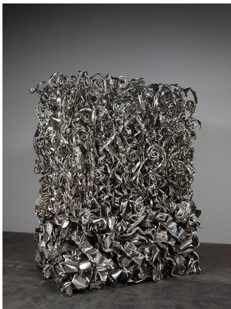
Neptune's Cap , 2005