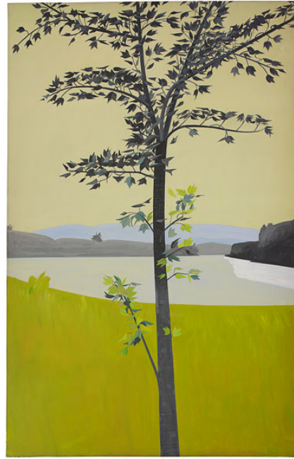
Swamp Maple, 4:30, 1968