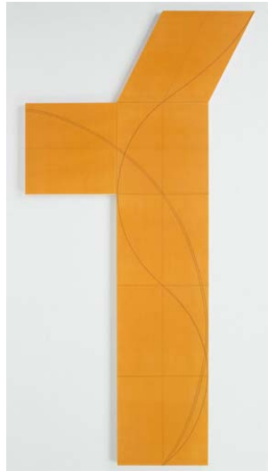
Column Structure VIII, 2006