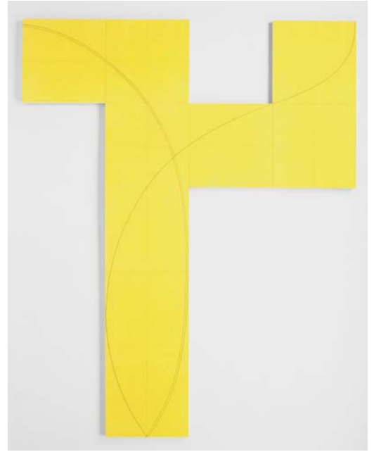
Column Structure IX