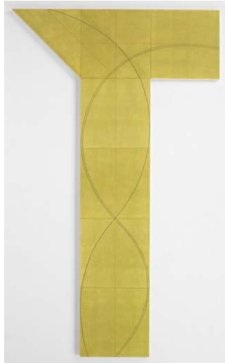
Column Structure VII, 2006