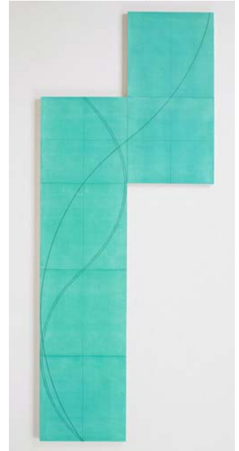
Column Structure XII , 2006