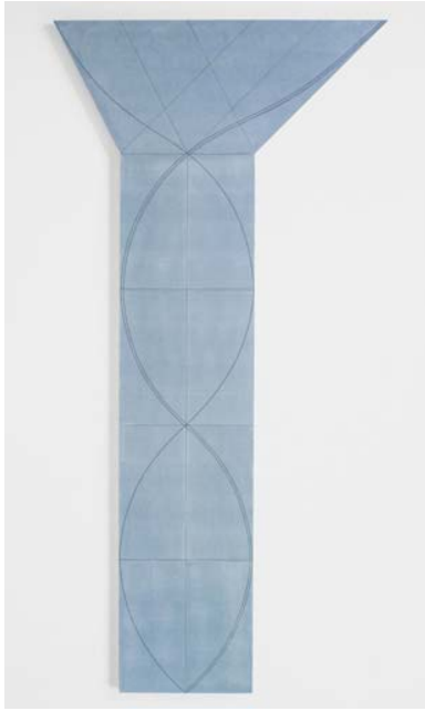
Column Structure V