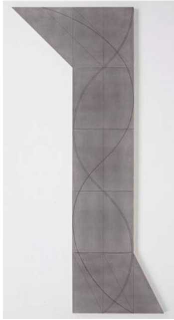
Column Structure VII, 2006