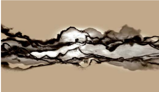
Fields of Fire , 2005