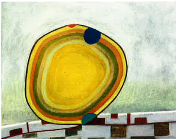
Untitled (8-93) , 2007 oil on linen on panel