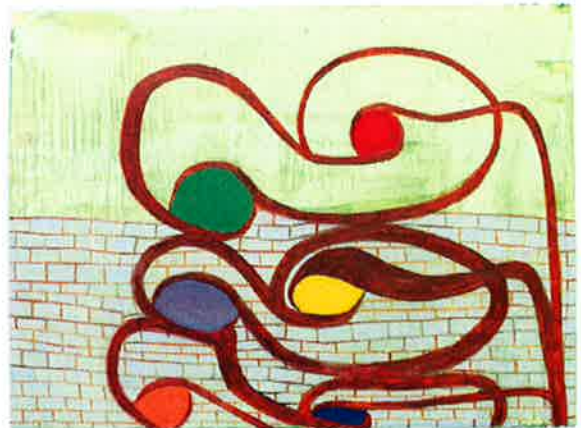
Untitled (P-19) , 2007 oil on paper