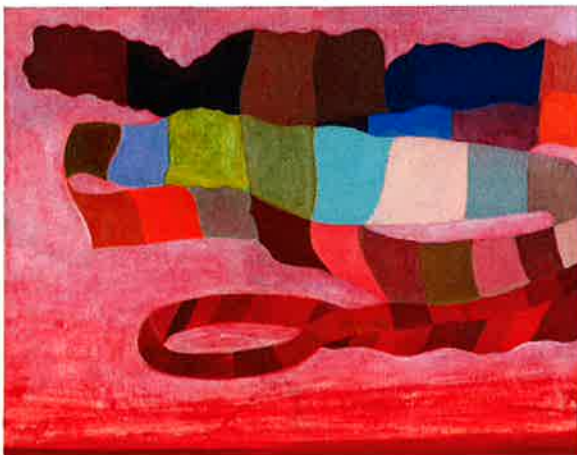
Untitled (8-100) , 2008 oil on linen on panel