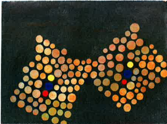
Untitled (P-16) , 2007 oil on paper