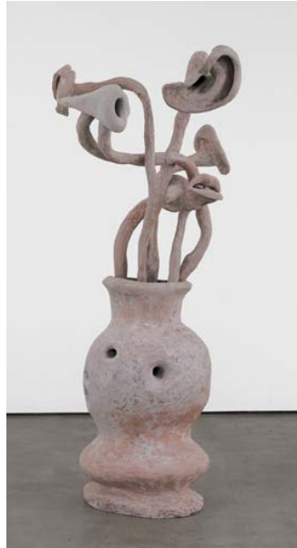
Head Plant , 2007 PaceWildenstein