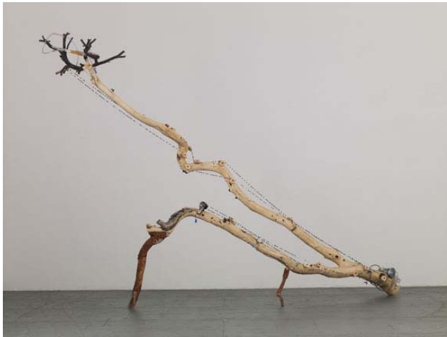
Deposition , 2007 PaceWildenstein