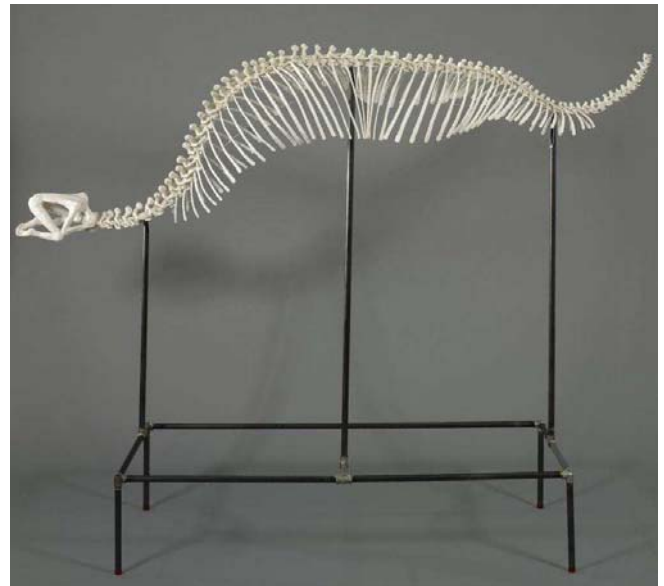
Leviathon , 2007 Currently on view at The J. Paul Getty Museum, Los Angeles