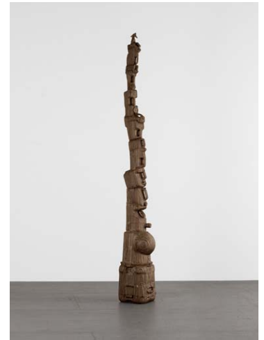
Totem , 2007 PaceWildenstein