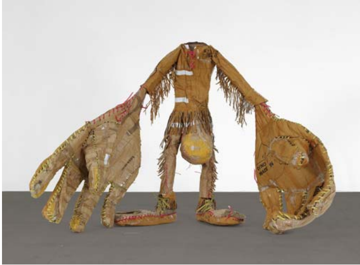
Scout, 2006-2007 PaceWildenstein