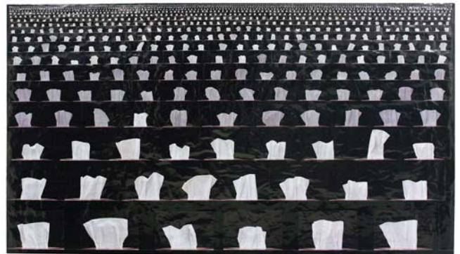
Veil , 2006 PaceWildenstein