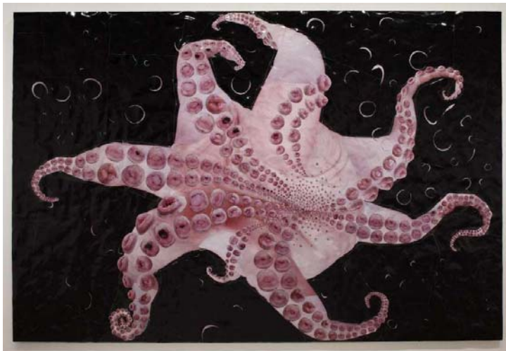
Octopus , 2006 Currently on view at The J. Paul Getty Museum, Los Angeles